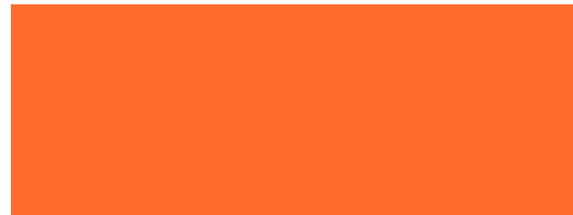
Pantone Orange 021 U

C: 0% M: 72% Y: 86% K: 0% H: 16° S: 82% B: 100% R: 255 G: 108 B: 44 Hex#: FF6C2C