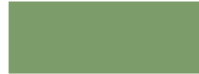
PANTONE 7490 U

C: 55% M: 24% Y: 71% K: 4% H: 97° S: 31% B: 61% R: 124 G: 156 B: 106 Hex#: 7C9C6A