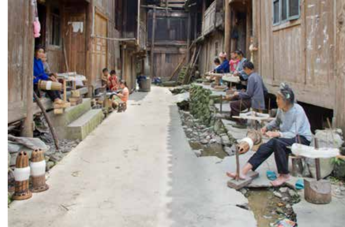
Neighbors Helping To Spin Cotton Thread On Bobbins