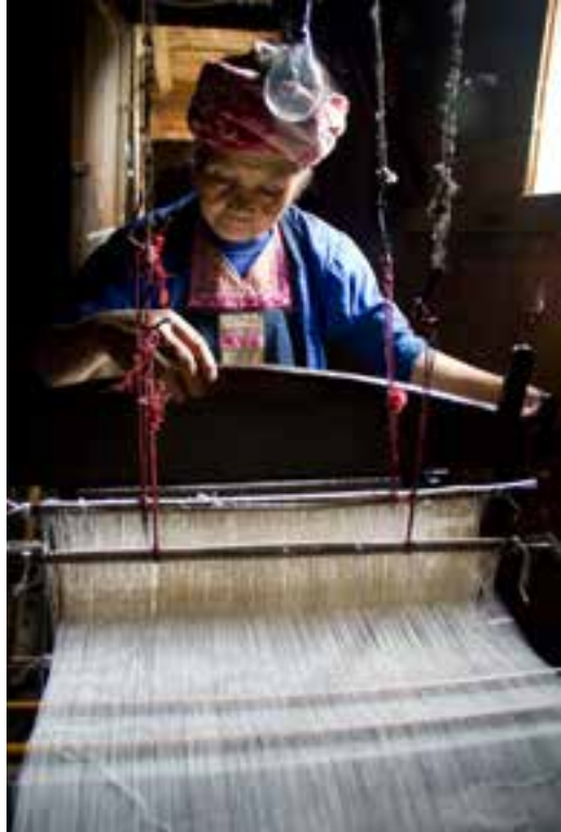
Woman Making Cloth