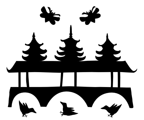
Design Pattern Based On Embroidery By Wu Meng Xi