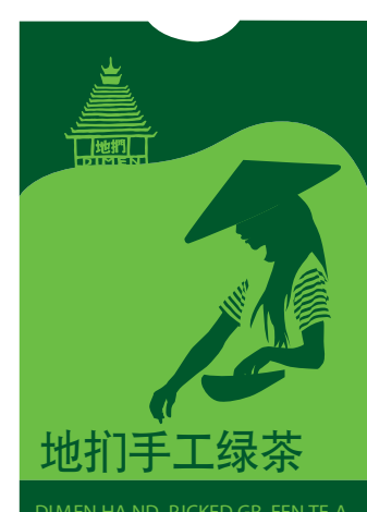
Dimen Tea Packaging