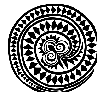
Design Pattern Based On Embroidery By Wu Meng Xi's Mother