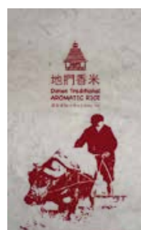
Dimen Rice Packaging