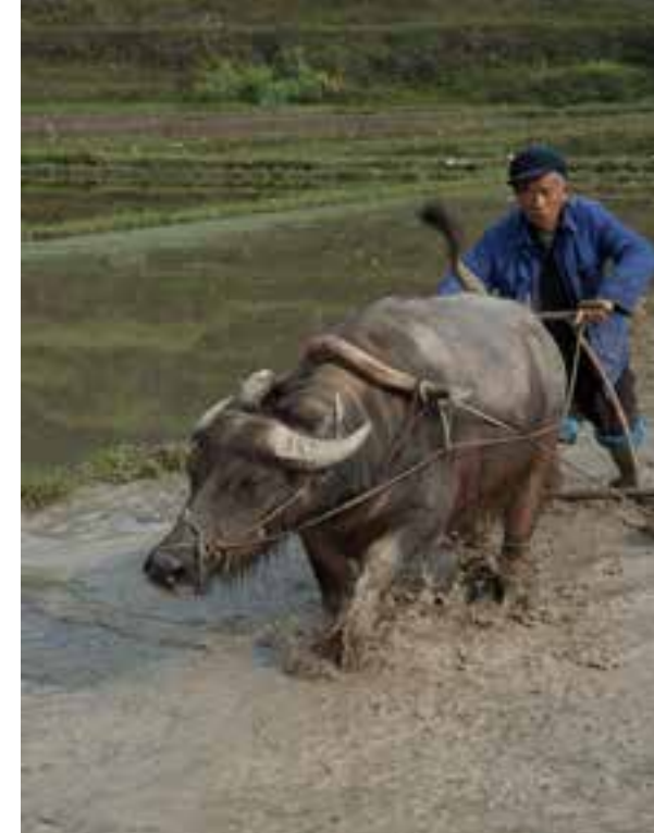
Man Plowing His Field