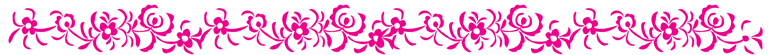
Design Pattern Based On Embroidery Paper Pattern By Wu Meng Xi