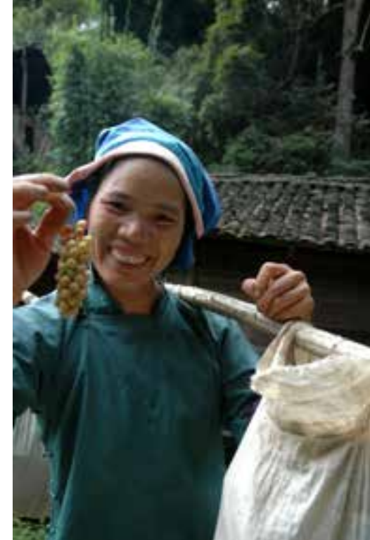
Woman Offering Fruit