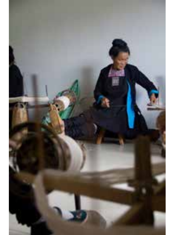
Woman Spinning Cotton