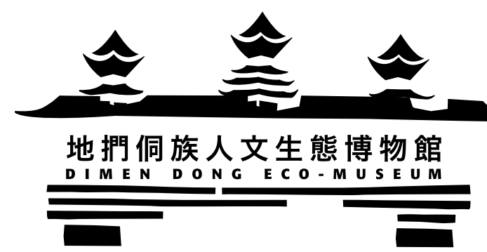
Dimen Dong Eco-Museum Logo