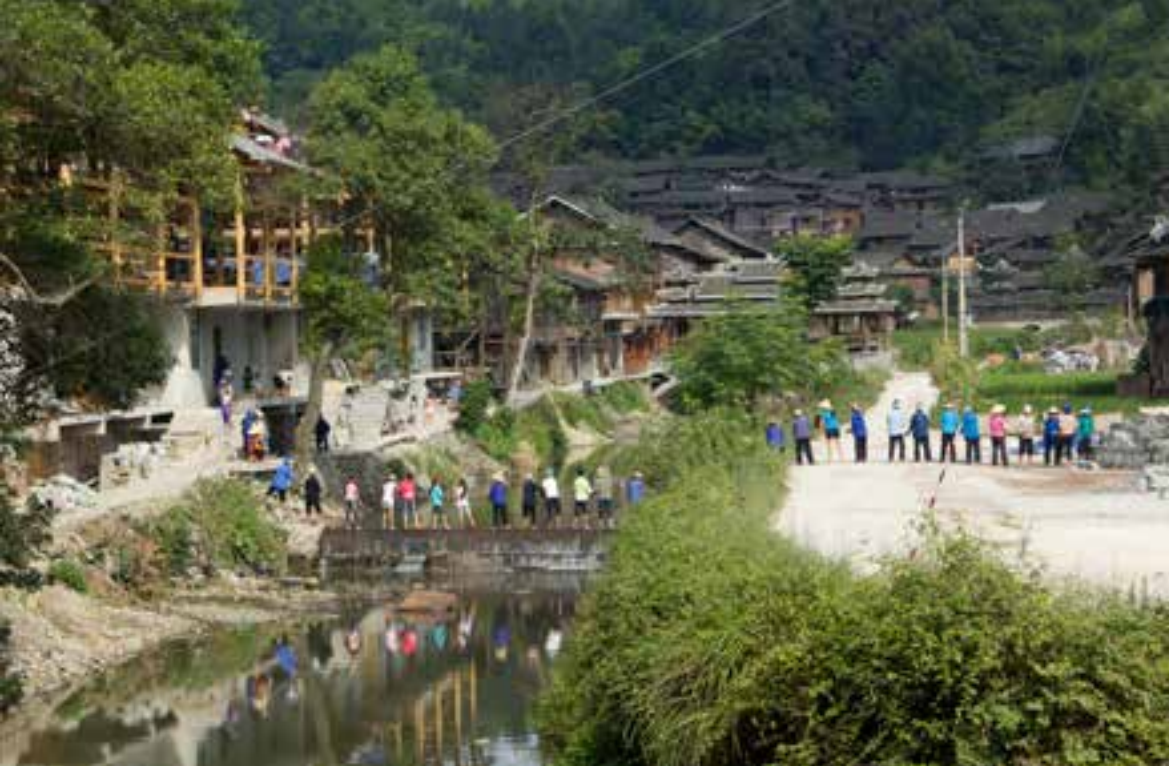
Neighbors Helping Move Roof Tiles Across The River