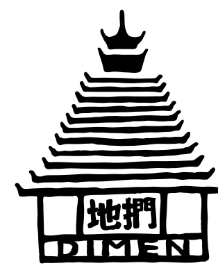
Dimen Brand Logo